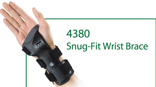
4380 Snug-Fit Wrist Brace

Elastic strap allows individual to easily adjust the space at the base of the thumb for better compliance and simple application.